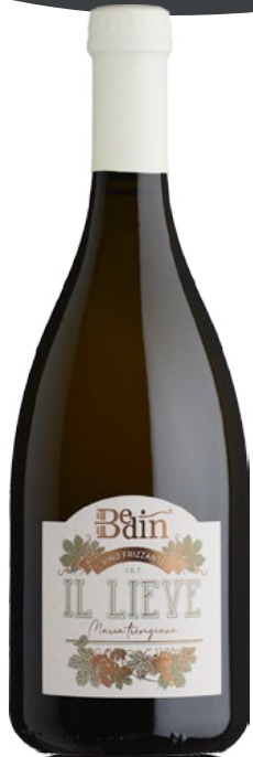
IL LIEVE MARCA TREVIGIANA IGT VINO FRIZZANTE