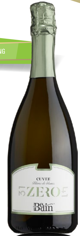
CUVÉE EXTRA DRY SPARKLING WINE