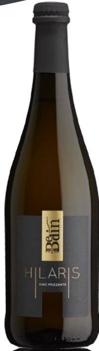
HILARIS MARCA TREVIGIANA IGT VINO FRIZZANTE