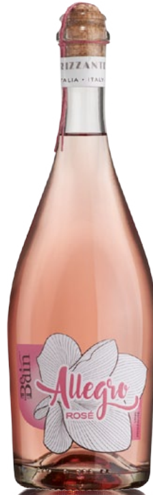
ALLEGRO ROSÉ MARCA TREVIGIANA IGT VINO FRIZZANTE