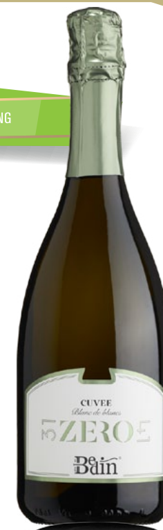
CUVÉE EXTRA DRY SPARKLING WINE