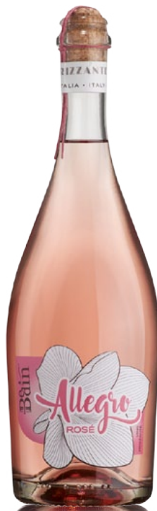
ALLEGRO ROSÉ MARCA TREVIGIANA IGT VINO FRIZZANTE