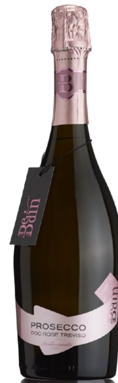
ROSÉ BRUT MILLESIMATO