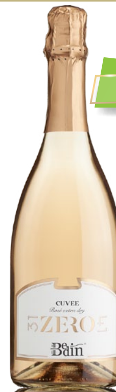
CUVÉE ROSÉ EXTRA DRY SPARKLING WINE