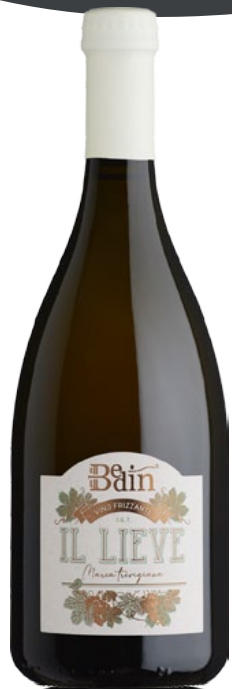
IL LIEVE MARCA TREVIGIANA IGT VINO FRIZZANTE