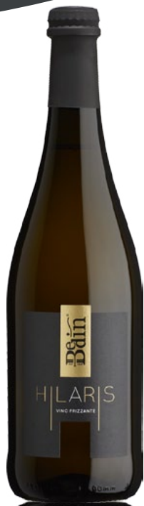
HILARIS MARCA TREVIGIANA IGT VINO FRIZZANTE